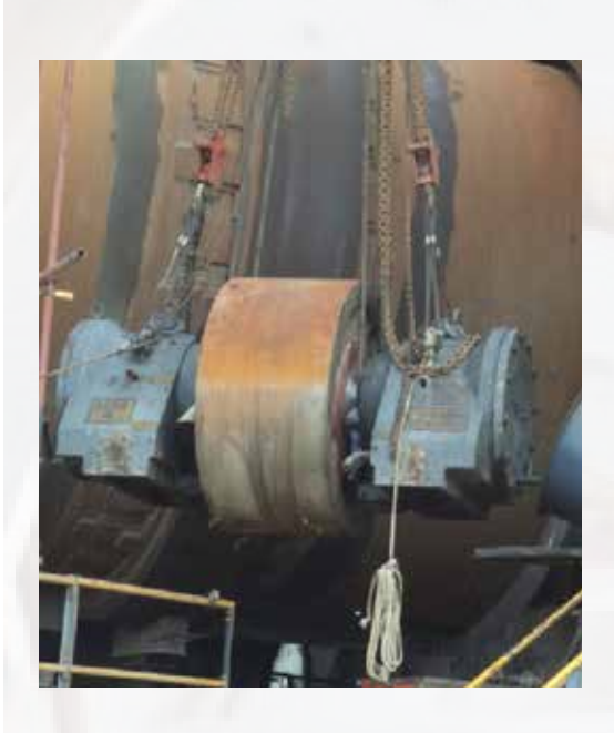
Kiln supporting roller Replacement