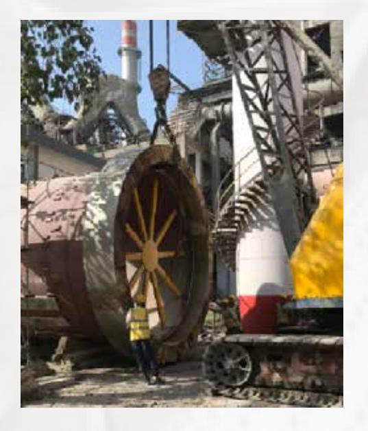
New tire assembly with kiln shell