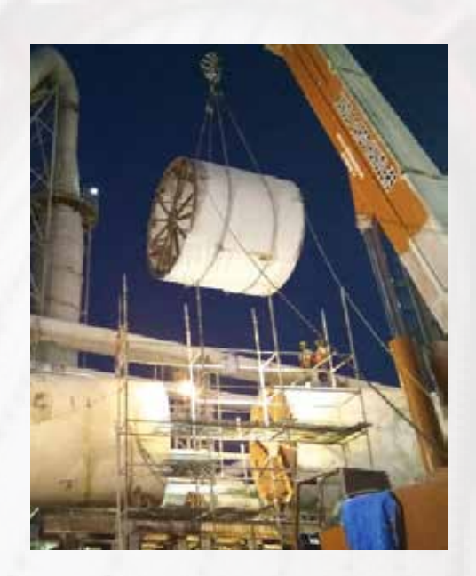
Kiln shell Replacement